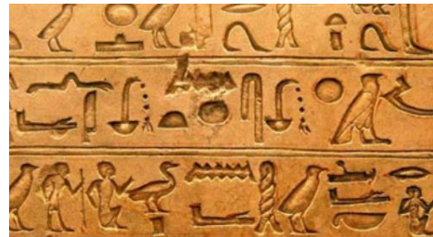
Hieroglyphics on Rosetta Stone